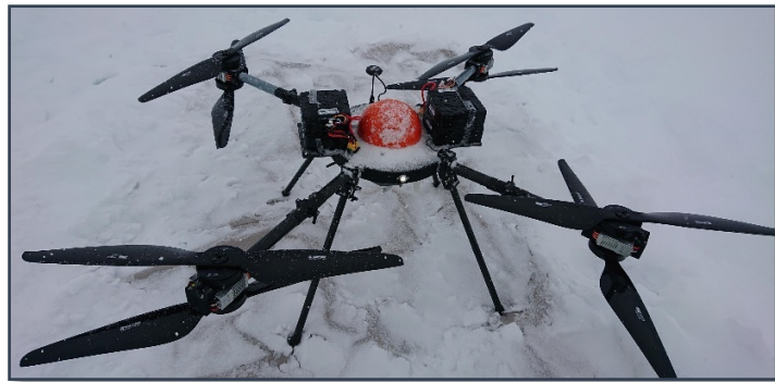
Figure 3: System with batteries mounted

The plot below shows how payload mass affects the endurance for the 32 Ah and the 44 Ah battery options. Note that to stay below a take-off weight of 25 kg, the 32 Ah batteries allow a payload of 9 kg and the 44 Ah batteries allow a 6.4 kg payload.