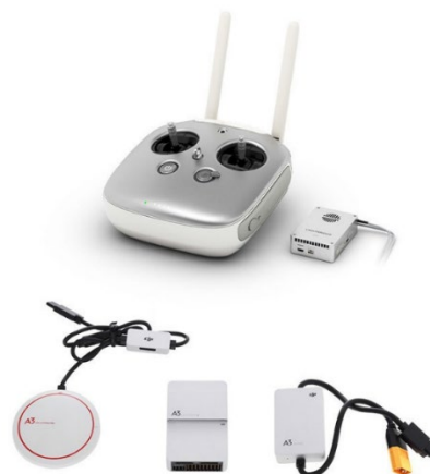
Figure 7: DJI A3 flight control system + Lightbridge 2 link

Optionally the Pixhawk can be replaced with a DJI A3 pro flight control system with a DJI Lightbridge 2 receiver and hand controller. This supports the use of DJI Go software and FlyLitchi. The Lightbridge 2 link is capable of transmitting HD video up to 2 km away.