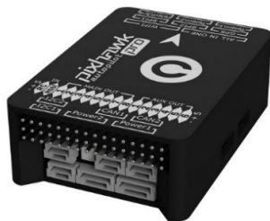
Figure 5: Pixhawk 3 Pro