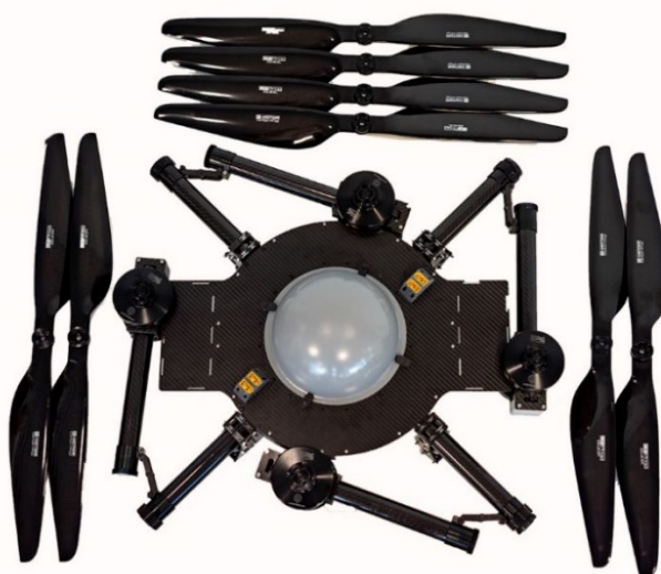
Figure 1: System seen from above with arms folded

The airframe is constructed with a combination of lightweight carbon fiber material and high-performance 3D-printed polymers. It has four fixed landing legs and four foldable arms. The frame has a payload mount on the bottom side.