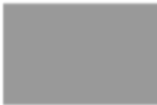
Figure 3: System with batteries mounted

The plot below shows how payload mass affects the endurance for the 32 Ah and the 44 Ah battery options. Note that to stay below a take-off weight of 25 kg, the 32 Ah batteries allow a payload of 9 kg and the 44 Ah batteries allow a 6.4 kg payload.