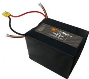
Figure 2: 6S Battery

The system is powered by two 6S LiPo battery packs wired in series, supplying 44,4 V with a total capacity of 32 Ah. Optionally the system can be provided with a 44 Ah battery set. Note that this will give a higher system weight and affect payload capacity.