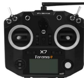
Figure 6: Taranis X7 hand controller