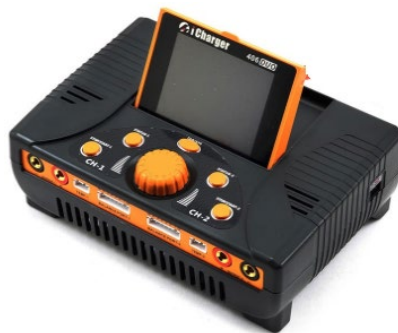
Figure 8: Battery charger

The iCharger 406Duo is used for charging the BG-200 battery packs safely and efficiently. The maximum charge power capacity is up to 1400W, the maximum charge/discharge current of a channel is up to 40A, and two channels in Synchronous Mode are up to 70A.