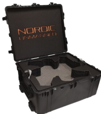
Figure 9: Casing

Casing for safe storage and transport can be provided. The case measures 40x82x70 cm.